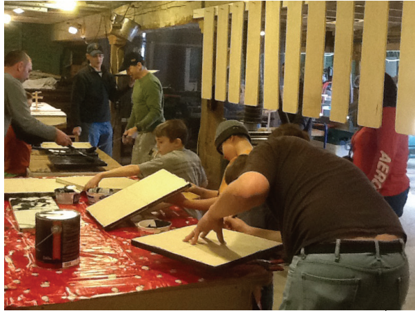
Cub Scouts from Pack 4 work on amputee boards for Sunnyview patients.

The scouts got together the weekend of January 26 - 27 to assemble and paint the boards. The older boys (Webelos in grades 4 and 5) did the assembly in the morning. In the afternoon, the younger boys (Tigers, Bears and Wolves in grades 1 and 3) did the painting.